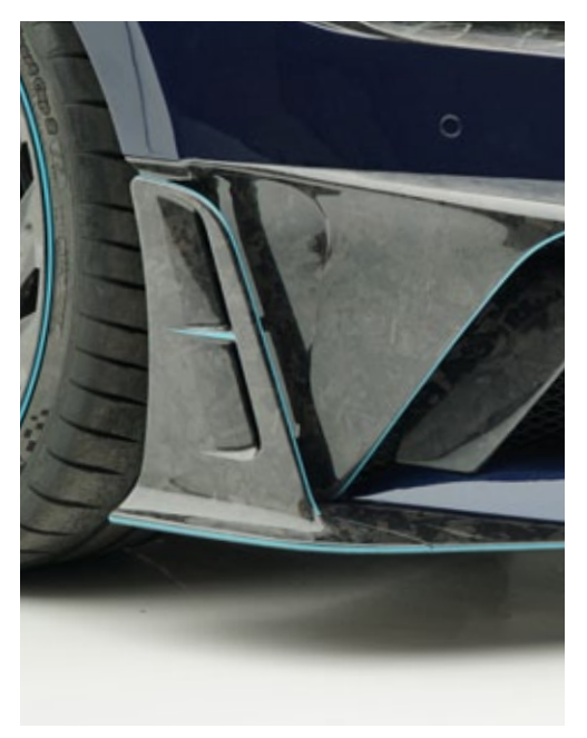
last update 04 / 2019