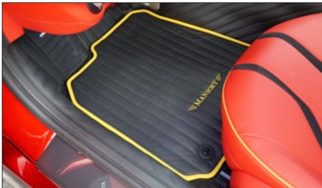
Floor mats individual FPF 367 759 with individual logo stitching, leather trim and custom colour 2 parts set - left & right