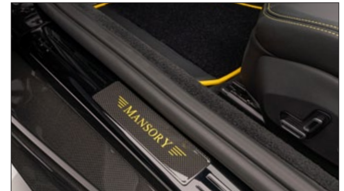
Entrance panels panel FPF 395 301 MANSORY logo 2 parts set - left & right visible carbon fibre glossy*