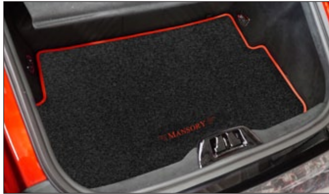
Trunk mat - carpet FPF 368 758 with MANSORY logo stitching, leather trim and custom colour