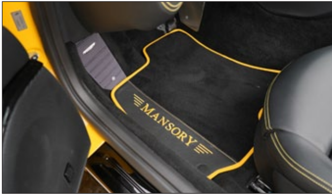
Floor mats - carpet FPF 367 758 with MANSORY logo stitching, leather trim and custom colour 2 parts set - left & right