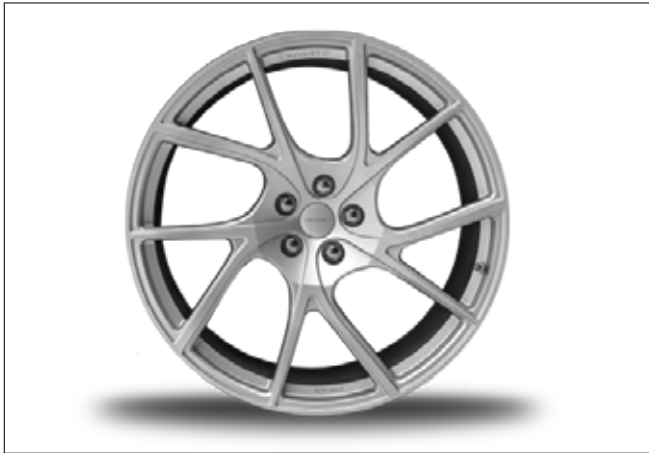
YT.5 Fully Forged wheels Black glossy