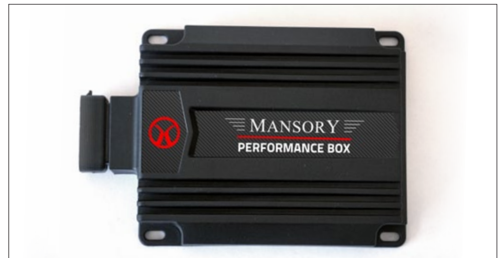
MANSORY Performance PowerBox for Portofino M MPB FPM 054