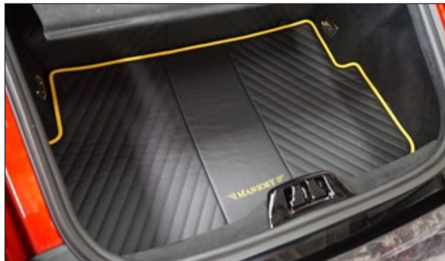
Trunk mat individual FPF 368 759 with individual logo stitching, leather trim and custom colour