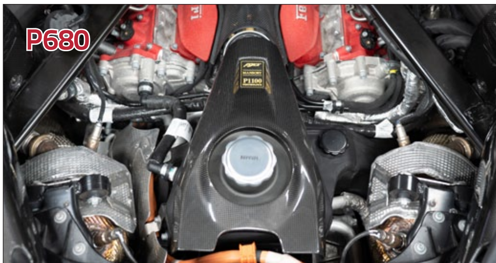
P680 Performance software MPU FPM 680