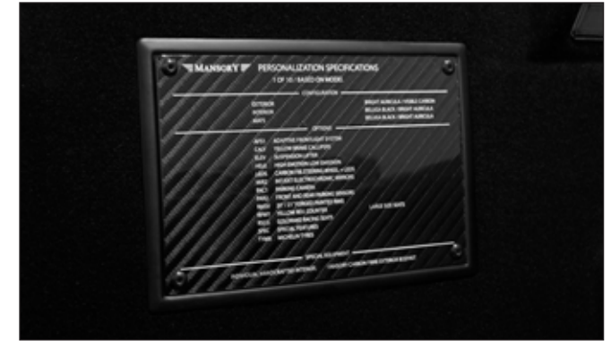
Custom trunk plakete FPF 140 550 visible carbon fibre glossy*