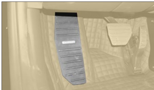
Foot rest FPF 367 127

2 parts set Consisting acceleration & brake pedal made of anodized aluminium.