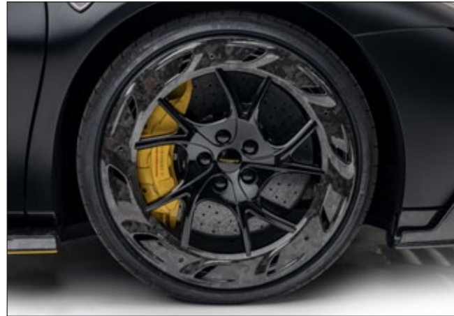
YT.5 Fully Forged wheels Black glossy with carbon splitter

📖 recommended tires FA: 245/30 21, RA: 305/25 22 Continental