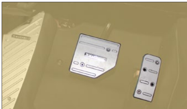
Pedal pads FPF 367 117

2 parts set Consisting acceleration & brake pedal made of anodized aluminium.