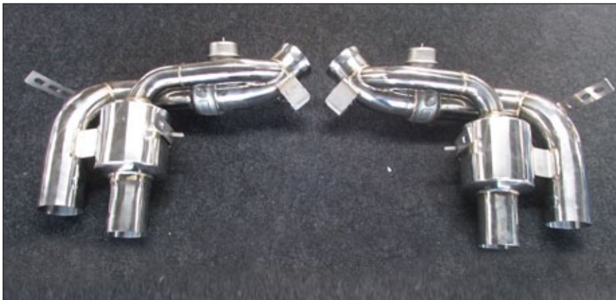
Exhaust for Ferrari Portofino

📖 recommended tires Pirelli FA: 275/30 21, RA: 335/25 22