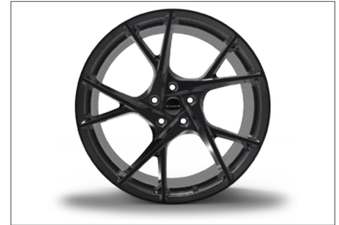
YN.5 wheel black glossy ultra-light forged wheels

📖 recommended tires FA: 245/30 21, RA: 305/25 22 Continental