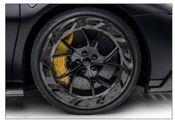
YT.5 Fully Forged wheels Black glossy with carbon splitter

recommended tires FA: 245/30 21, RA: 305/25 22 Continental