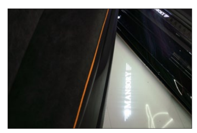
Door welcome lights with MANSORY logo set left & right for front door

visible carbon fibre primed without clear coat Available with individualized letterings/design.