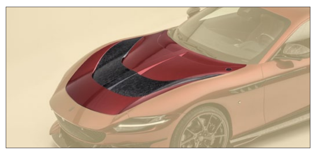
Front bonnet FRO 110 002 primed not visible carbon fibre