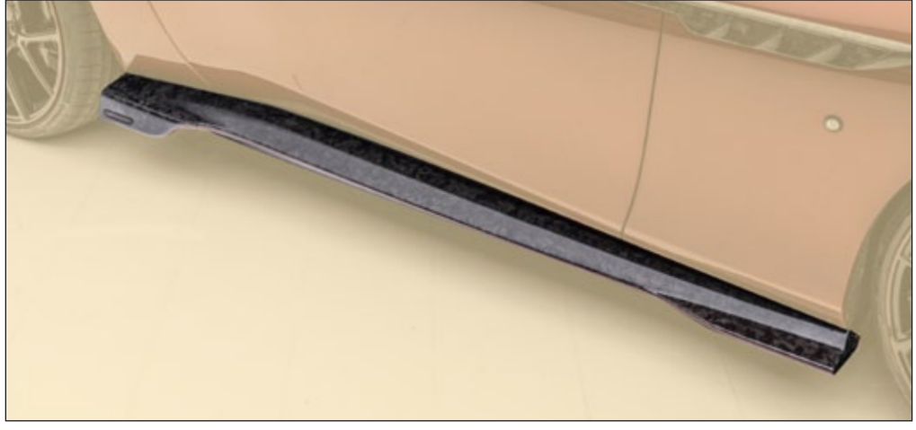
Side skirts lip

i) not compatible with MANSORY Front Bumper