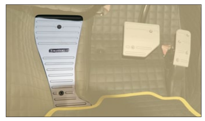
Foot rest, LHD FRO 367 127 Aluminium anodized Foot Rest (1 piece)