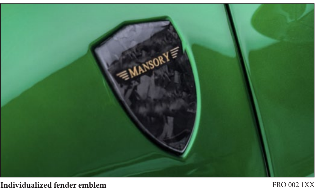
Individualized fender emblem

visible carbon fibre primed without clear coat 2 parts set - left & right, Available with individualized letterings/design.