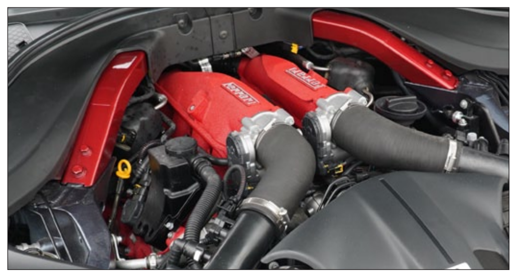
Performance software O modification only, OE - ECU required