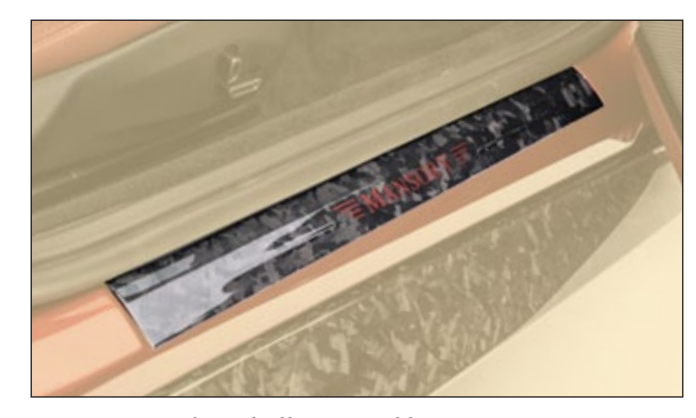
Entrance panels with illuminated logo

Complete refined interior, with exclusive leather, combination on customers request.