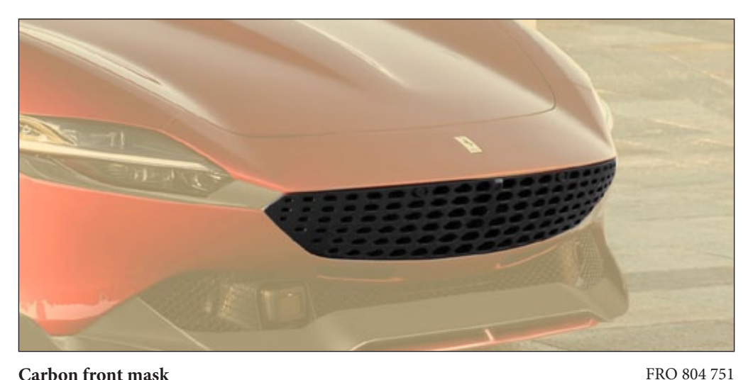
Carbon front mask

visible carbon fibre primed without clear coat 2 set - left & right