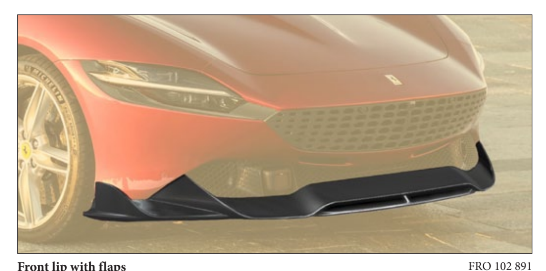
Front lip with flaps

visible carbon fibre primed without clear coat