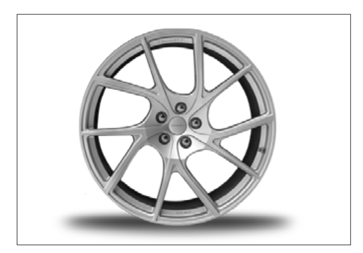
YT.5 Fully Forged wheels Black glossy