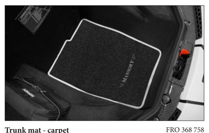
Trunk mat - carpet with MANSORY logo stitching, leather trim and custom colour