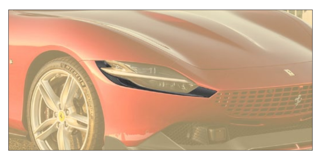
Front light air vents

visible carbon fibre glossy*, with silver logo