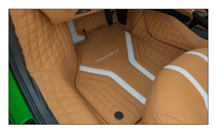
Floor mats individual with individual logo stitching, leather trim and custom colour 2 parts set - left & right