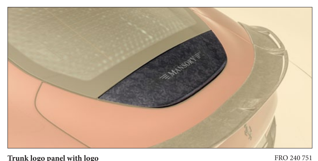
Trunk logo panel with logo

4 parts set - left & right visible carbon fibre primed without clear coat