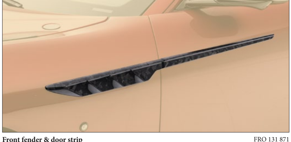
Front fender & door strip

2 parts set - left & right, visible carbon fibre glossy*, with logo