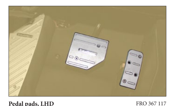
Pedal pads, LHD 2 parts set Consisting acceleration & brake pedal made of anodized aluminium.