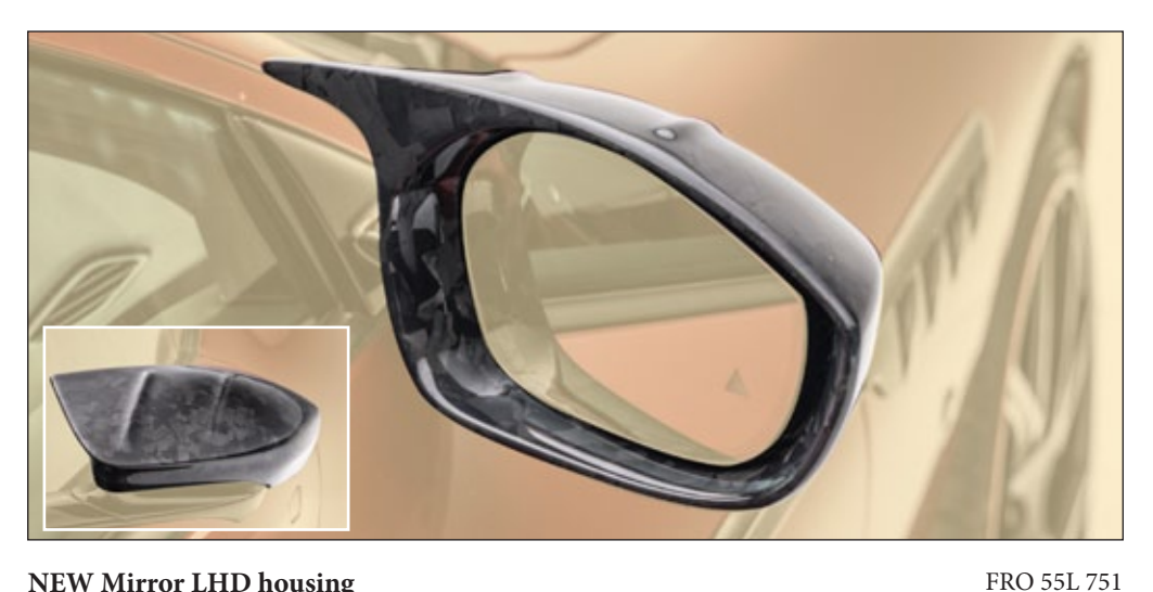
NEW Mirror LHD housing

2 parts set - left & right, visible carbon fibre glossy*, with logo