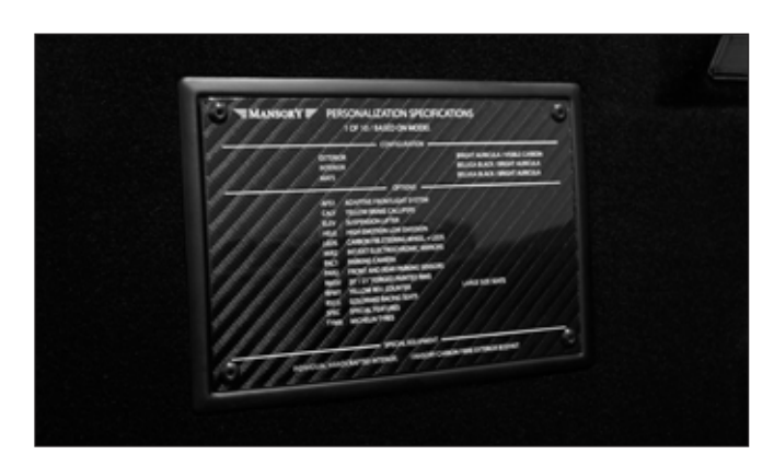
Custom trunk plakete visible carbon fibre glossy*

2 parts set - left & right, with individual writing/design.