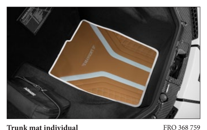
Trunk mat individual with individual logo stitching, leather trim and custom colour