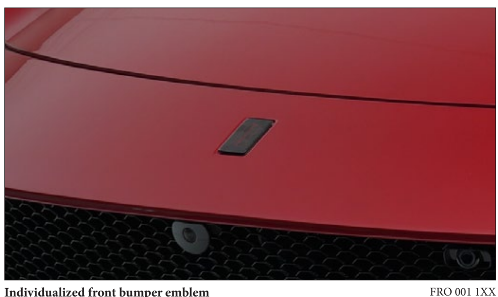
Individualized front bumper emblem

visible carbon fibre primed without clear coat Available with individualized letterings/design.