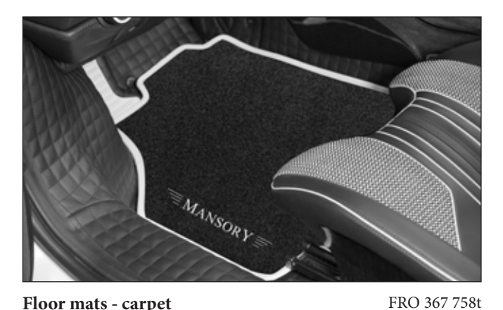
Floor mats - carpet with MANSORY logo stitching, leather trim and custom colour 2 parts set - left & right