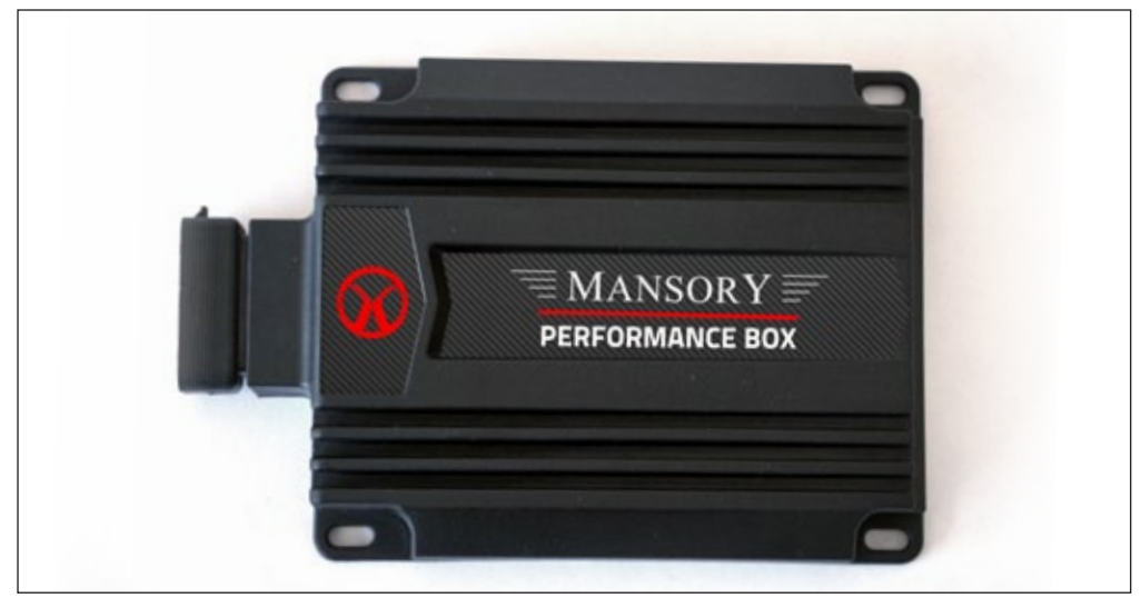
MANSORY\ Performance\ PowerBox\ for\ Roma