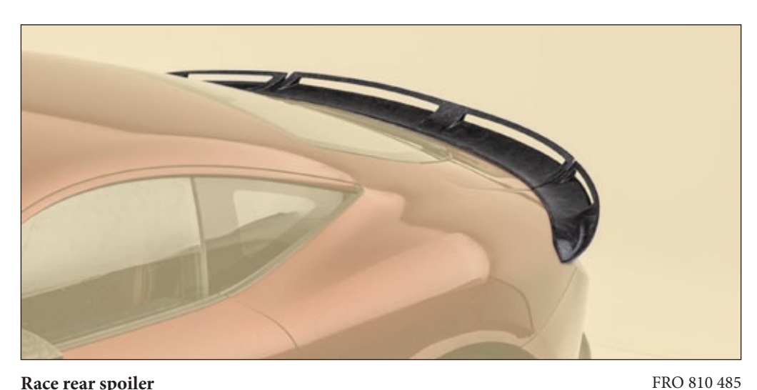
Race rear spoiler visible carbon fibre primed without clear coat 3 parts set

visible carbon fibre primed without clear coat